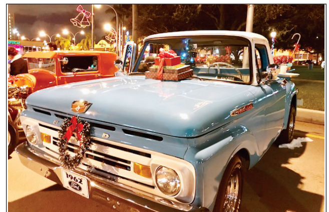
ANNUAL HOLIDAY CAR SHOW