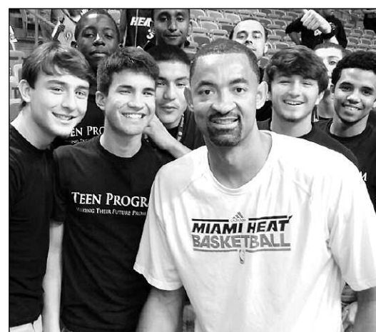
Participants in the Miami Springs Rec Teen Program met Miami Heat player Juwan Howard and attended the Miami Heat vs Celtics game.

Tuesday & Thursday: 5:00 p.m. - 6:00 p.m.