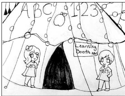
Come enjoy art work by Blessed Trinity students during the month of May!