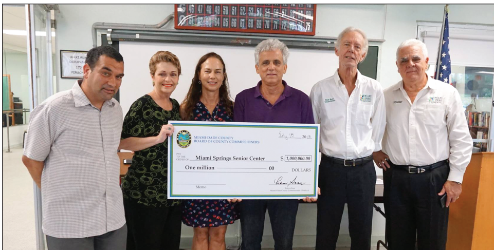
Miami-Dade Commissioner Rebeca Sosa presents a $1 million check to be used in the construction of a new Senior Center.

Recreational and social events are planned each month at the senior center. The following activities are currently planned for August: celebration of August birthdays and anniversaries (8/16); weekly Bingo games (8/6, 8/13, 8/20 and 8/27); and shopping trips to Walmart, and various grocery stores each week. Additional recreational activities