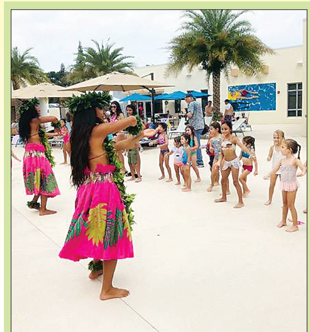
Aquatic Center's Annual Luau Party.

Promises of ongoing classes is in the forecast.