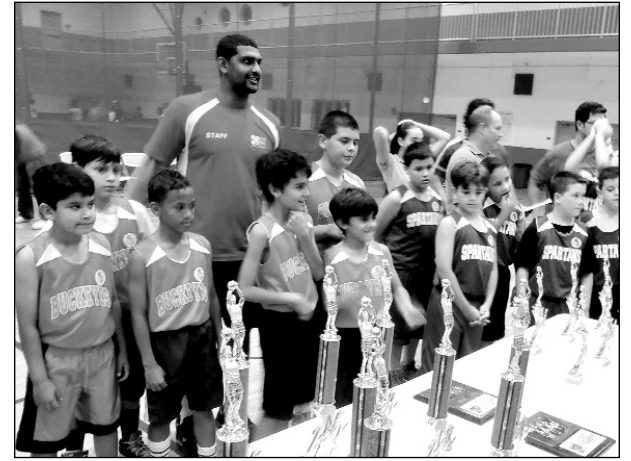
After the 9 & 10 year old championship basketball game the players are all smiles awaiting their trophies!

classes are offered year round. Our prices are $45.00 per session and we offer various types of classes.