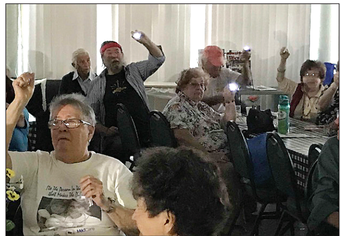
Seniors "Shine a Light" on lung cancer.