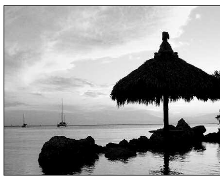
Victor Linares, Tiki, C-print, 16" x 20"

Scenic photographs and photo montages by photographer Victor Linares will be featured for "Art in City Hall" during the month of October, 2013.